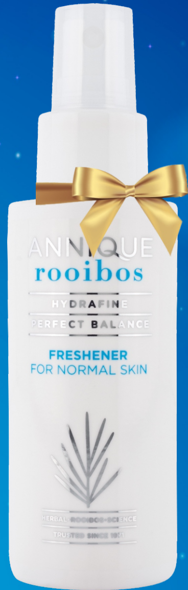
Hydrafine Freshener 100ml

Soothes, hydrates, conditions and softens normal and combination skin, helps absorb excess oil on the skin surface and reduces shine on the T-panel.