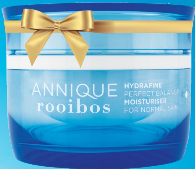
Hydrafine Moisturiser 50ml

Soothes, hydrates, conditions and softens normal and combination skin, helps absorb excess oil on the skin surface and reduces shine on the T-panel.